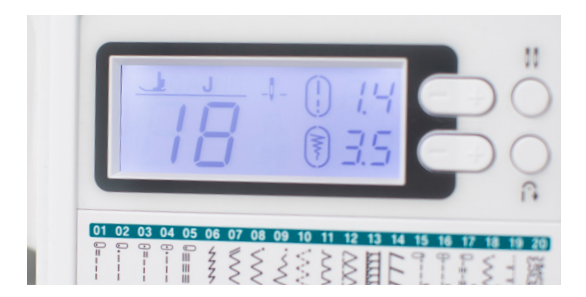
LCD Screen - See all of your stitch information at a glance with a clear, vivid LCD screen.