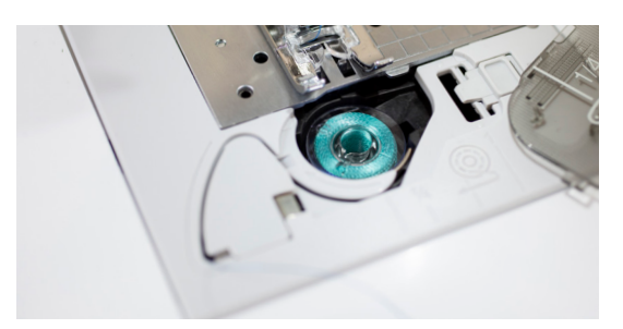
Quick-Set, Drop-In Bobbin - Simply drop your bobbin in the machine, pull your threads through the slot and let your machine do the rest.