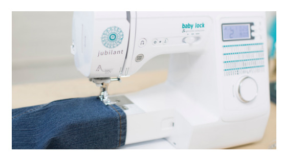
Free-Arm Sewing - Want to hem pants, work on a sleeve or sew in a hard-to-reach area? No problem. Just easily remove the flatbed and use Jubilant's free arm.