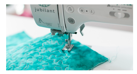
Drop Feed for Free-Motion Techniques - Add a personal touch to your quilts. Easily lower the feed dogs with the flip of a switch and freely move your work for total control.