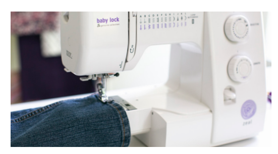
Free-Arm Sewing - Want to hem pants, work on a sleeve or sew in a hard-to-reach area? No problem. Just easily remove the flathed and use Zeal's free arm.