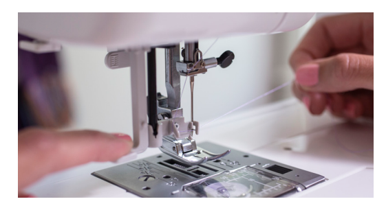
Built-In Needle Threader - With just a few simple motions, your needle is threaded and ready to use. There's no guesswork, no near-misses and no frustration!