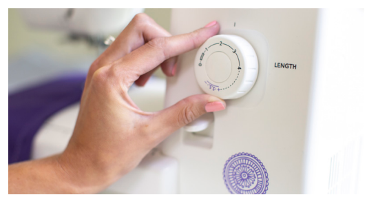
Variable Stitch Length and Width - Adjust the length and width for variety or specific techniques like basting or gathering.