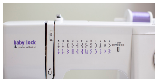
25 Stitches - Add your unique touch to every project with a library of stitches that sets everything apart!