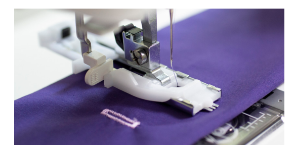
Built-In Buttonhole - With the buttonhole foot, your one-step buttonhole will be automatically sized to match your button every time.