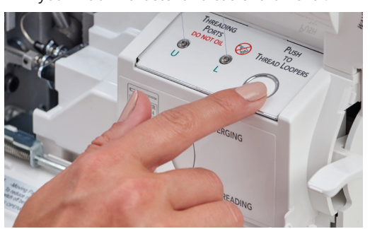
Revolution Air Looper Threading Insert thread into one of the Acclaim's threading ports, push the button and a gust of air quickly pushes it through the patented tubular loopers, exactly where you need it every time. Tangles, knots and breakage are now a thing of the past!