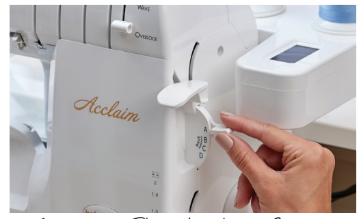
Automatic Thread Delivery System Set the Acclaim to the type of stitch you want and never worry about tension adjustments again. Enjoy perfectly balanced stitches regardless of the type of fabric you're using. And ATD lets you thread your loopers in any order.