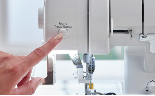
RevolutionAir™ Needle Threading Engage the RevolutionAir™ threader, push a button and the Acclaim's needles are threaded! Baby Lock's RevolutionAir Threading makes setting up your machine faster and easier than ever.