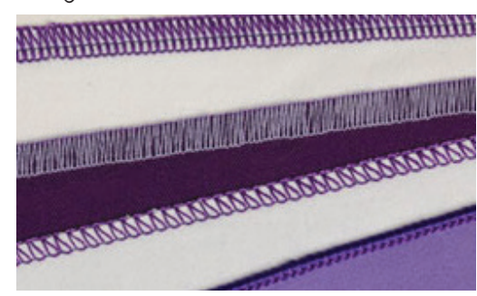
4/3/2 Thread Serging Finish projects with quality and versatility - easily switch from 4, 3 or 2 thread rolled hemming options.