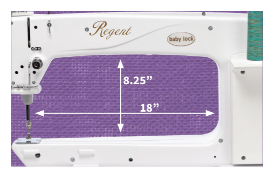
18" Creative Workspace With 18" to the right of the needle and an 8.25" high throat space, the Regent gives ample room to finish quilts of all sizes.