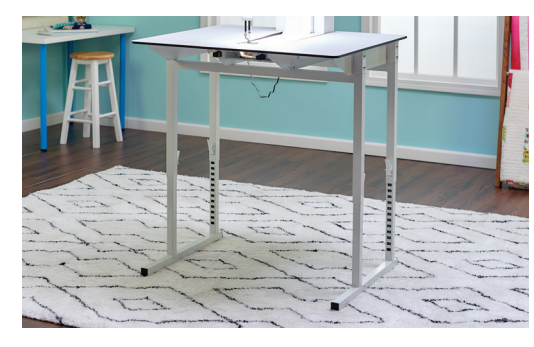
Smooth, Adjustable Table The Regent comes with its own quilting table with Stitch Harmony Stitch Regulation built right in.