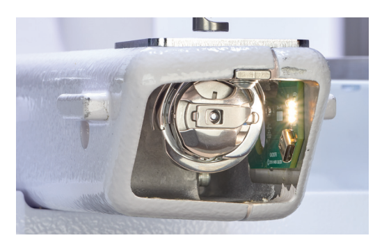
M-Class Bobbin You'll need fewer bobbin changes with the highspeed rotary hook and large-capacity M-class bobbin.

Enjoy free-motion quilting at a comfortable pace with the Stitch Harmony Stitch Regulation. Built into the Regent's table insert, the automated regulator helps you achieve evenly spaced, consistent stitches every time. This easy-to-use stitch regulation is helpful for quilters of all skill levels.